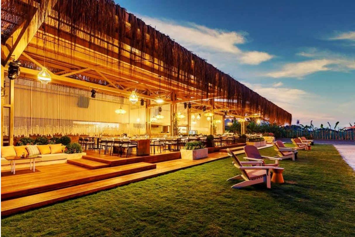
The Palazzo Lounge

Visitors headed to Türkiye should also be sure to take advantage of the ‘ Istanbul Stopover Service ’ from Turkish Airlines . Rich in history, filled with fantastic cuisine and bridging two continents, any chance to visit Istanbul should be taken advantage of and instead of just switching flights at the airport, Turkish Airlines offers Business Class travelers with lengthy layovers a complimentary three night stay at a 5-star hotel. Economy class travelers aren’t left out either, they get a two night stay at a 4-star hotel. And if you don’t have the days available for a full stay you can opt for a long layover instead. The airline’s Touristanbul program, complimentary when layovers are six hours or longer, provides a day tour of historical sites, a chance to sample Istanbul cuisine and transportation to and from the airport.