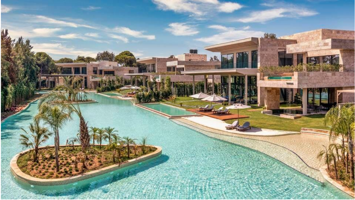
The Mansions at Kaya Palazzo Belek

For those looking for even more space and privacy the Mansion and Grand Mansions, four and five-suite private residences, opened last year. These stand-alone houses have their own saunas and steam rooms, both fresh-water and sea-water pools, fire pits and terraces. Need a place to land your helicopter? An upgrade to the just-opened Royal Mansion will better suit your needs.