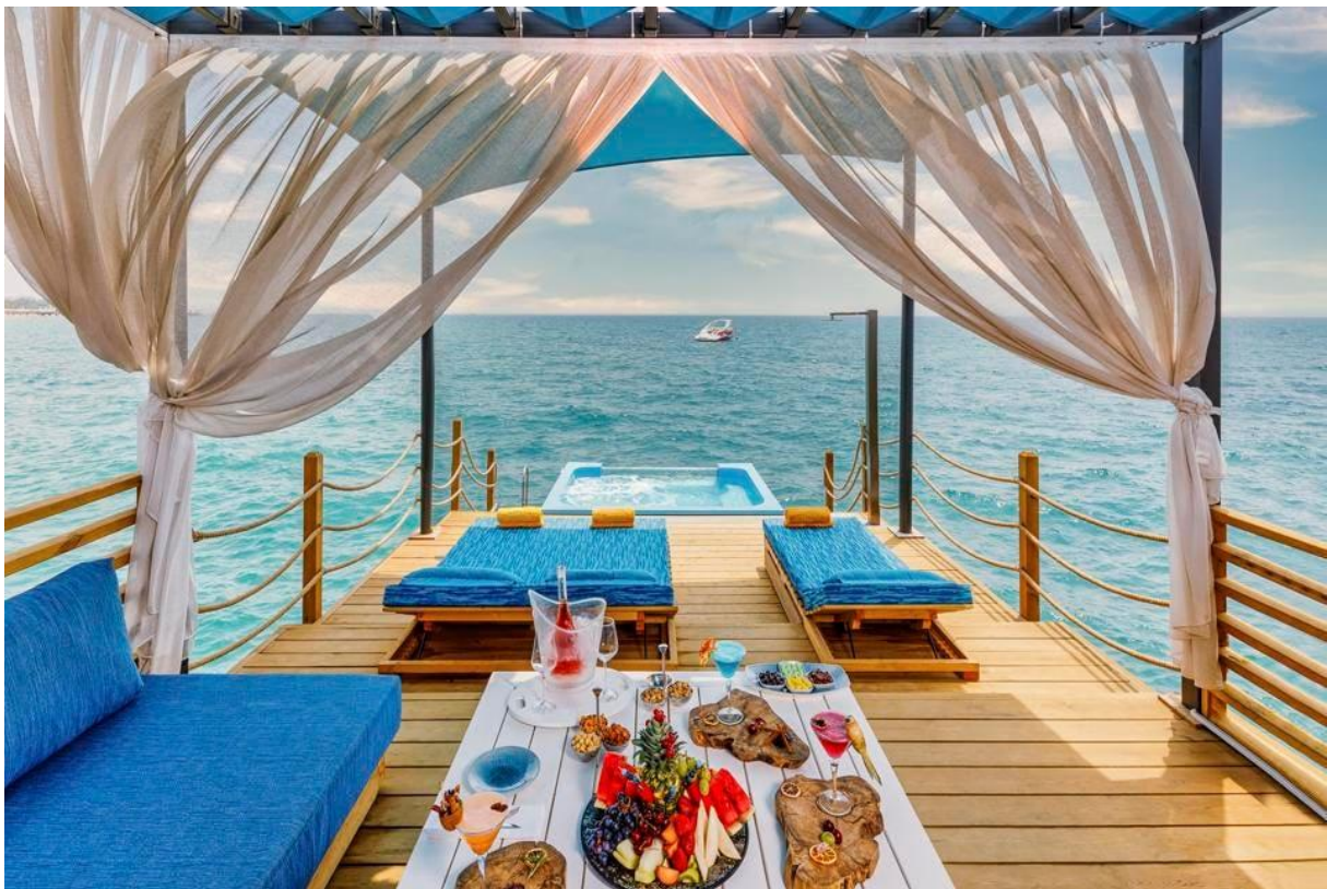
Cabana at Kaya Palazzo Belek

The Mediterranean coastline in southwest Türkiye (the preferred name of Turkey) has long been a vacation paradise — and if the crossroads of beach and luxury with some international travel added in sounds appealing then start planning your next trip to Kaya Palazzo Golf Resort Belek .