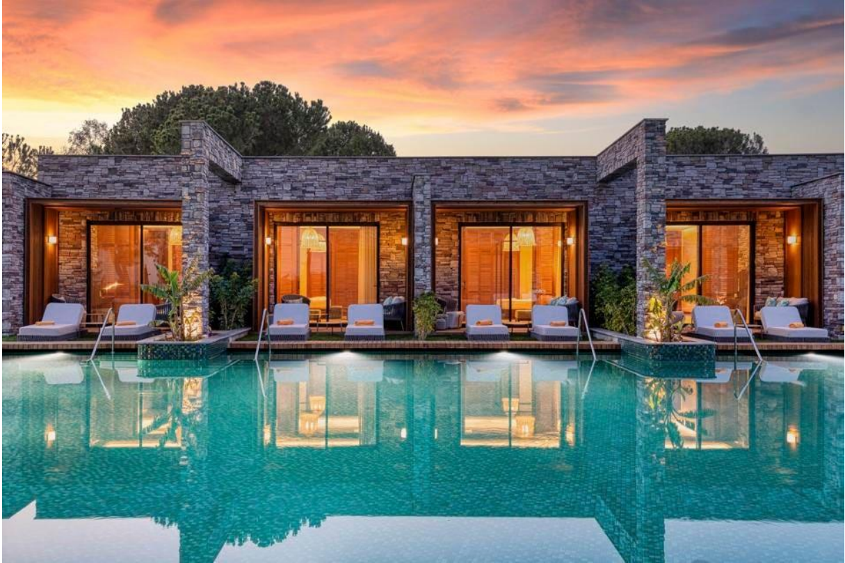
Lagoon Suites at Kaya Palazzo Belek

For all day dining, those staying at the Lagoon Suites have their own Lagoon Restaurant, while the Mansion guests have the Golf Club Restaurant. Within the main resort building there are four specialty restaurants to enjoy: Develi which features Turkish cuisine, Serafina for Italian dishes, Yada Sushi for Asian-inspired cuisine and the Palazzo Steak House (for when you've worked up a true appetite).