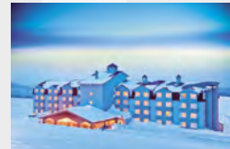
ULUDAĞ - BURSA