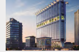
ÇANKAYA - ANKARA OPENING 2022