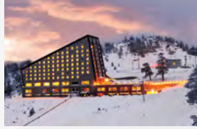
KARTALKAYA - BOLU