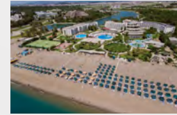
SIDE - ANTALYA