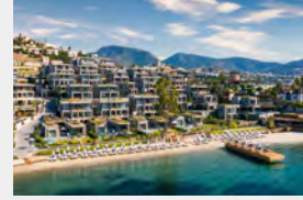
BODRUM - MUĞLA