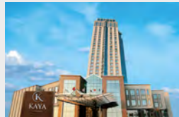
BEYLIKDUZU - ISTANBUL