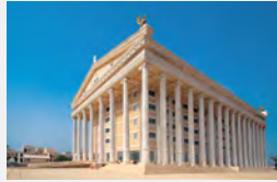
BAFRA - CYPRUS