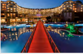
BELEK - ANTALYA