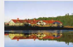
GEREDE - BOLU