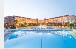
BELEK - ANTALYA