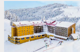
KARTALKAYA - BOLU