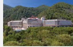
BALÇOVA - IZMIR