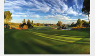
BELEK - ANTALYA